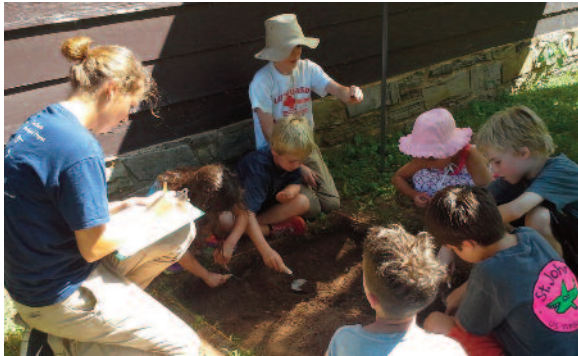
Children get a hands-on history lesson at Archaeology Camp.