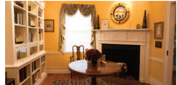
The Prich Matthews History Center

Throughout the year, The Jacobus Vanderveer House is open for house tours, lectures, children's and school group programs and presentations featuring re-enactors, artists and Colonial craftspeople. Our annual Colonial Christmas welcomes a growing number of visitors each holiday season.