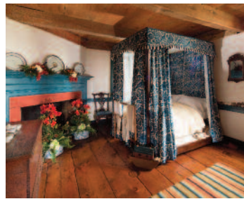
The Knox Bedroom