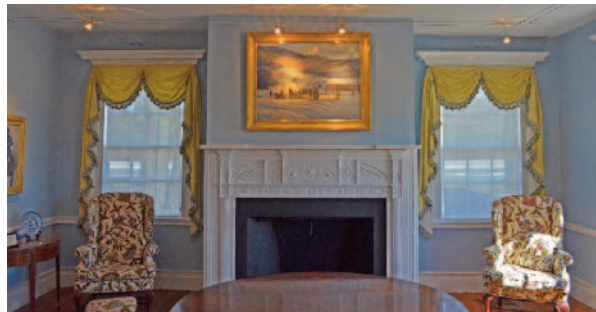
1813 Main Parlor

The Friends of the Jacobus Vanderveer House came together in 1998 as a 501(c)(3) nonprofit organization to restore and develop the historic site as an important educational and cultural resource. Since then, the Friends have restored the house, created historically accurate period room exhibitions, established historic collections, supported important research, and embarked on a program of education and interpretation to tell the stories of General Henry Knox, the Pluckemin military encampment and the community's key role in the American Revolution.