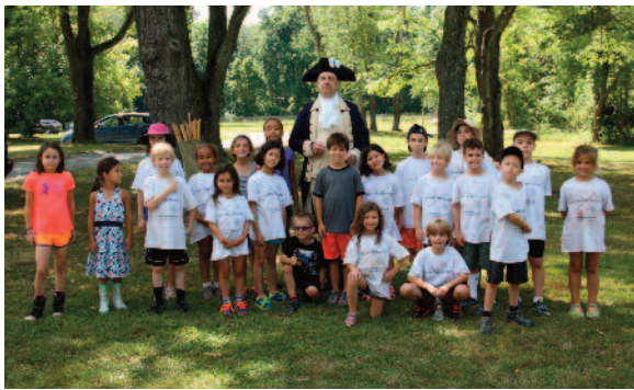
General George Washington commands a pint-size infantry.