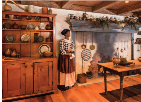
The Kitchen Hearth Exhibit

Green Acres funding. The house was listed in 1995 on the National and New Jersey Registers of Historic Places.