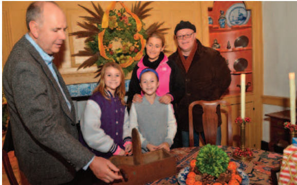
Knowledgeable docents offer visitors guided tours.