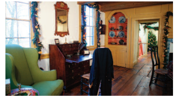
The Vanderveer Parlor