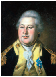
General Henry Knox (1750-1806)