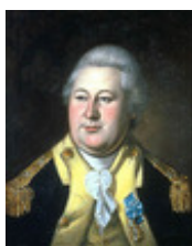
General Henry Knox