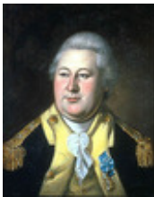
General Henry Knox

Thank you for your contributions and support!