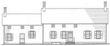
JACOBUS VANDERVEER HOUSE & MUSEUM BEDMINSTER, NEW JERSEY