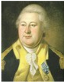
General Henry Knox